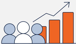
More demanding shoppers